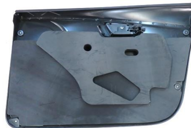
View of the door panel in location